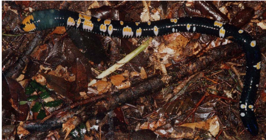
Fig. 2. Archipheretima middletoni sp. n. on forest floor at collection site.

encroaching on 6/7/8/9; one GM missing from vi in some specimens; female pores paired in xiv; male pores transverse slits superficial on xviii on ovate to hemispheric porophores, 0.19–0.21 circumference apart, 12–26 setae between male pores, male field strongly concave. Clitellum annular xii–xvii, 1/2 xviii; genital markings intersegmental paired oval to lanceolate in line with male pores on 17/18/19/20, 20/21 (some), 21/22 (some); those of 17/18/19 curved around porophores (Fig. 1C). Dorsal, lateral setae confined to white spots or narrow white equatorial stripes, ventral unpigmented segmental equators with closely spaced setae about 25 per cm, total setal counts 52 setae on vii, 49 setae on x, 48–60 on xxv; numbers dependent on presence of dorsal spots, spot-free post-clitellar segments with about 50–56 setae; ventral gap AA:AB = 2:1